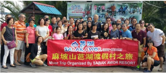
We were in a group with 30-plus other residents of Taman Jurong

For those without ample cash to travel, it is not the end of the world. There are nearby places that afford good country retreat away from the stress of the concrete jungle here.